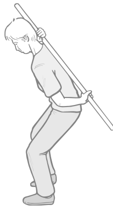
Fig. 1 Squatting by bending from the waist which can harm the back.