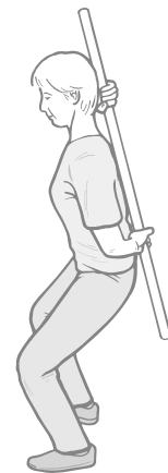
Fig. 2 Squatting with hip hinge to protect the back.